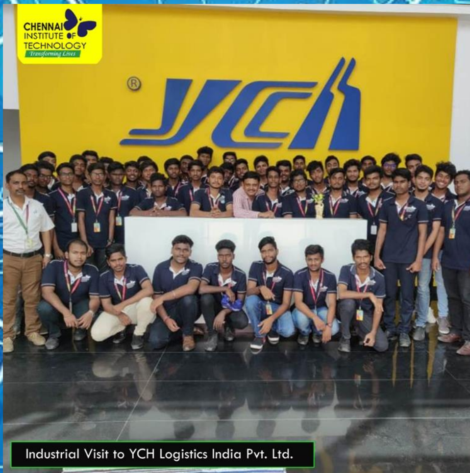
Industrial Visit to YCH Logistics India Pvt. Ltd.

YCH's proven RELIABILITY to perform its best is the company's assurance of professionalism. We strive for an uncompromising commitment to INTEGRITY in all business activities. SINCERITY is demonstrated by the genuine care and interest in the welfare of its clients and staff. Finally, our innovative spirit in meeting new challenges reflects our dynamic ENTERPRISE in achieving our corporate goals.