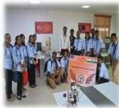
Students from Malaysia, in 3D Printing Lab