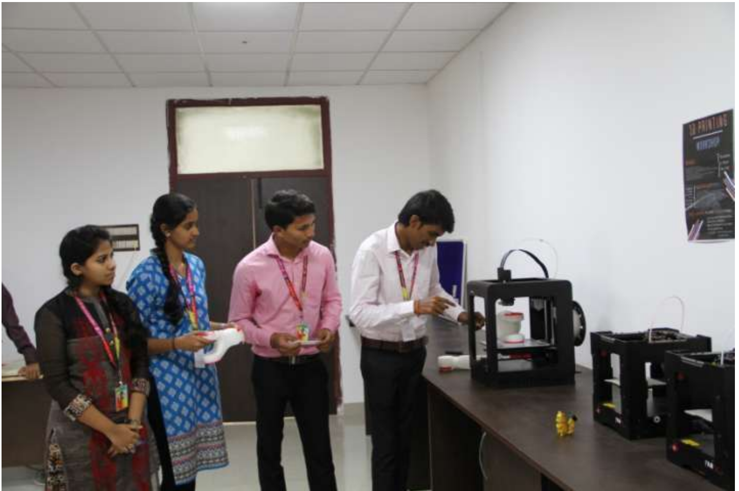
STUDENTS GETTING HANDS ON TRAINING IN 3D PRINTING TECHNOLOGY

Objective: It all starts with the creation of a 3D model in your computer. This digital design is for instance a CAD (Computer Aided Design) file. A 3D model is either created from the ground up with 3D modeling software or based on data generated with a 3D scanner. With a 3D scanner you're able to create a digital copy of an object. With these advanced manufacturing techniques students can achieve greater results in manufacturing era.