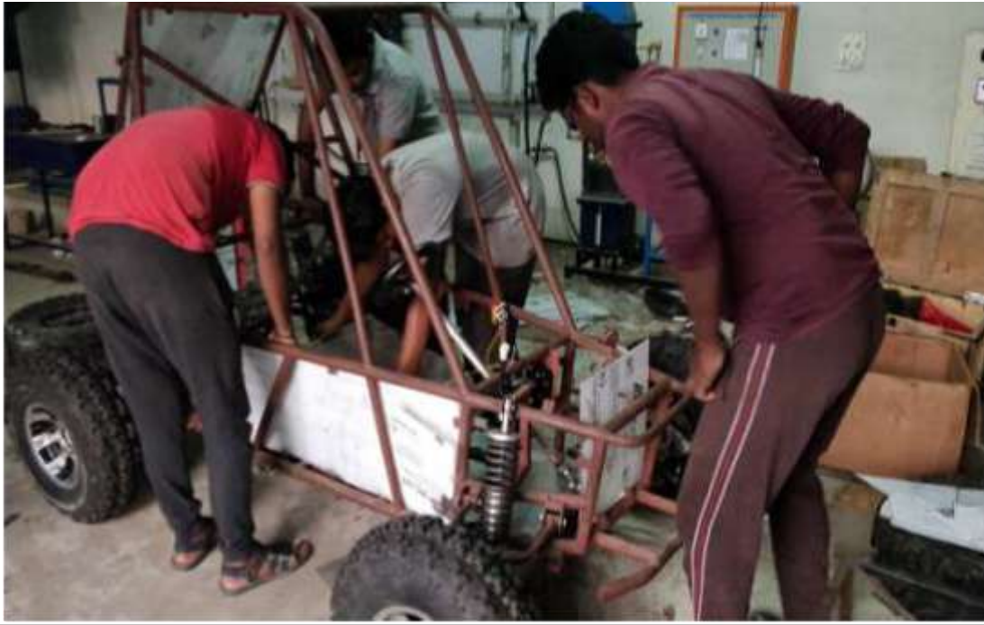
SAE-BAJA AND E-BAJA ATV VEHICLE MANUFACTURING AND RACING COMPETITION