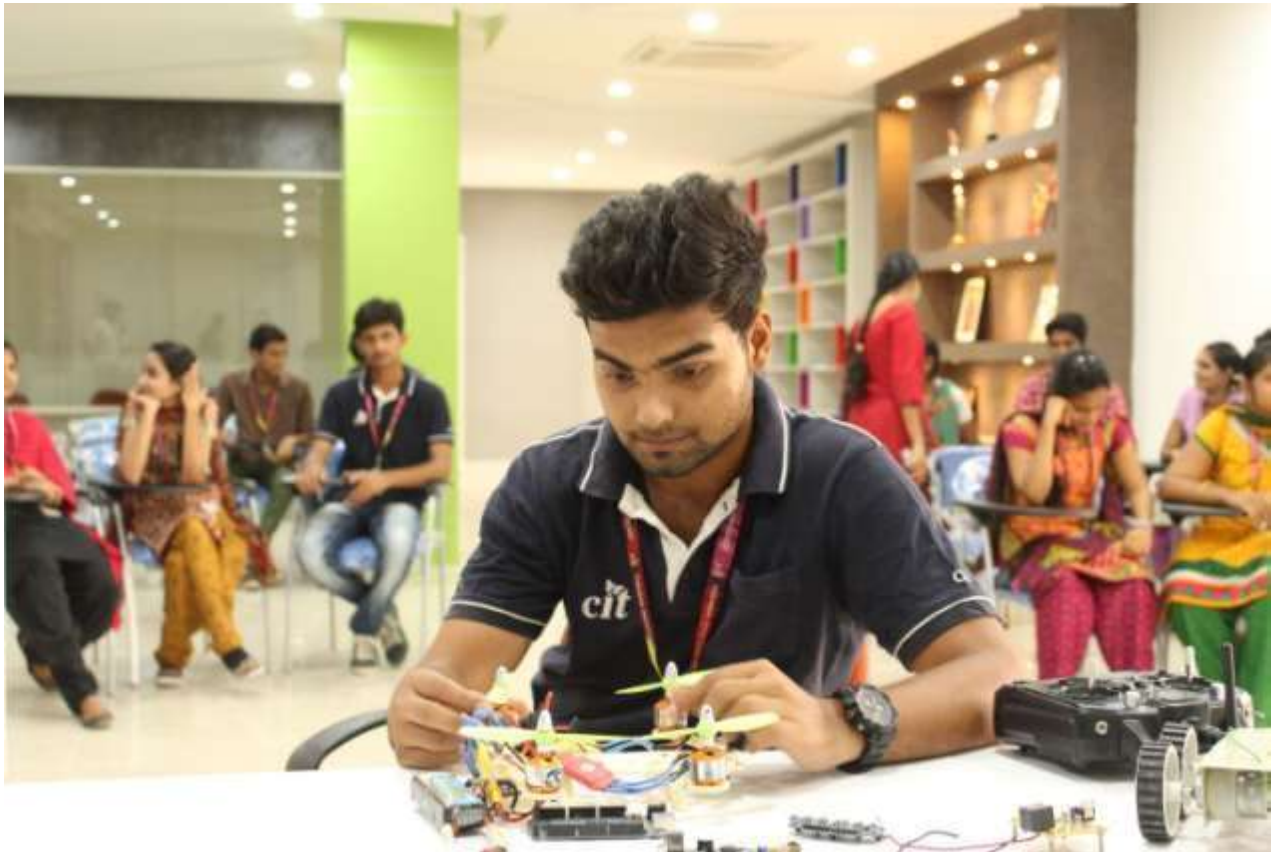
STUDENT MAKING PROJECTS IN INNOVATIVE LEARNING PROGRAM

Objective: Toppers given freedom to study the subject of their interest on their own and their timing and efficiency is effectively utilized at Innovative Learning Centre to learn the technology updates by working with industrial projects, to participate in various national and international competitions, incubation cell, and attending internships. Other students given the opportunity to make the presentations of various applications of the subject or content beyond the syllabus , develop the model / charts / projects related to their subject of interest.