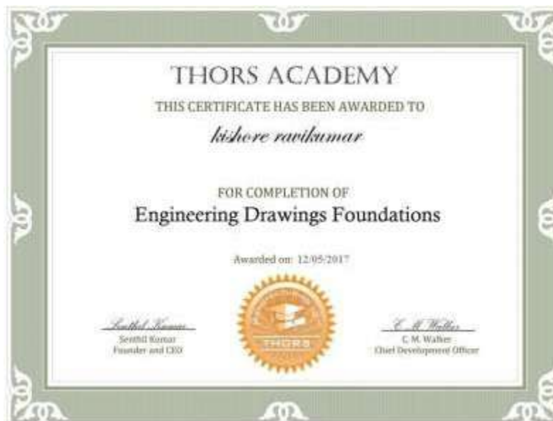
THORS ACADEMY CERTIFICATE OF FACULTY