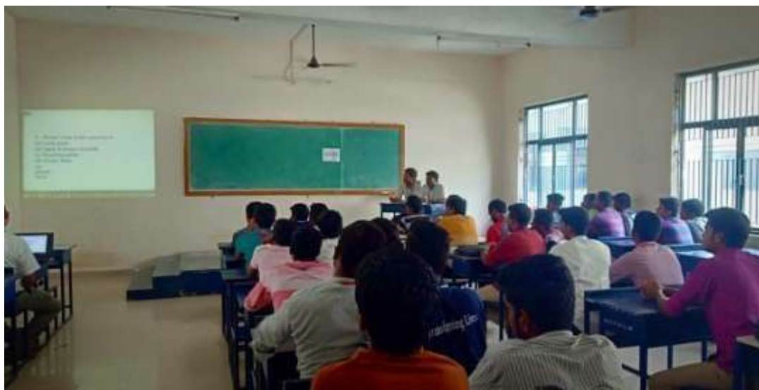
QUESTIONS PROJECTED TO THE STUDENTS