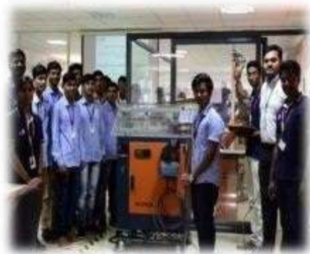
Students from Shreeyash College of Engineering and Technology, Aurangabad, in Kuka Robotics training