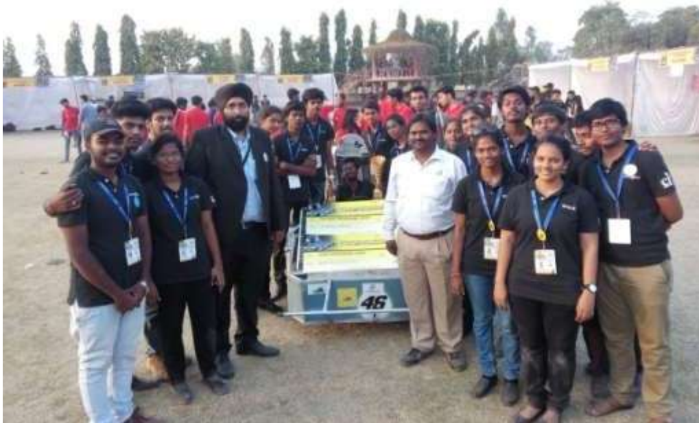
ISVC- SOLAR VEHICLE MANUFACTURING AND RACING COMPETITION