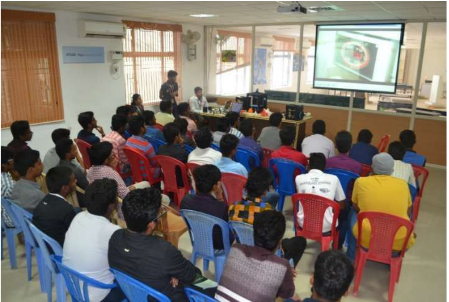
WORKSHOP ON 3D PRINTING AND REVERSE ENGINEERING