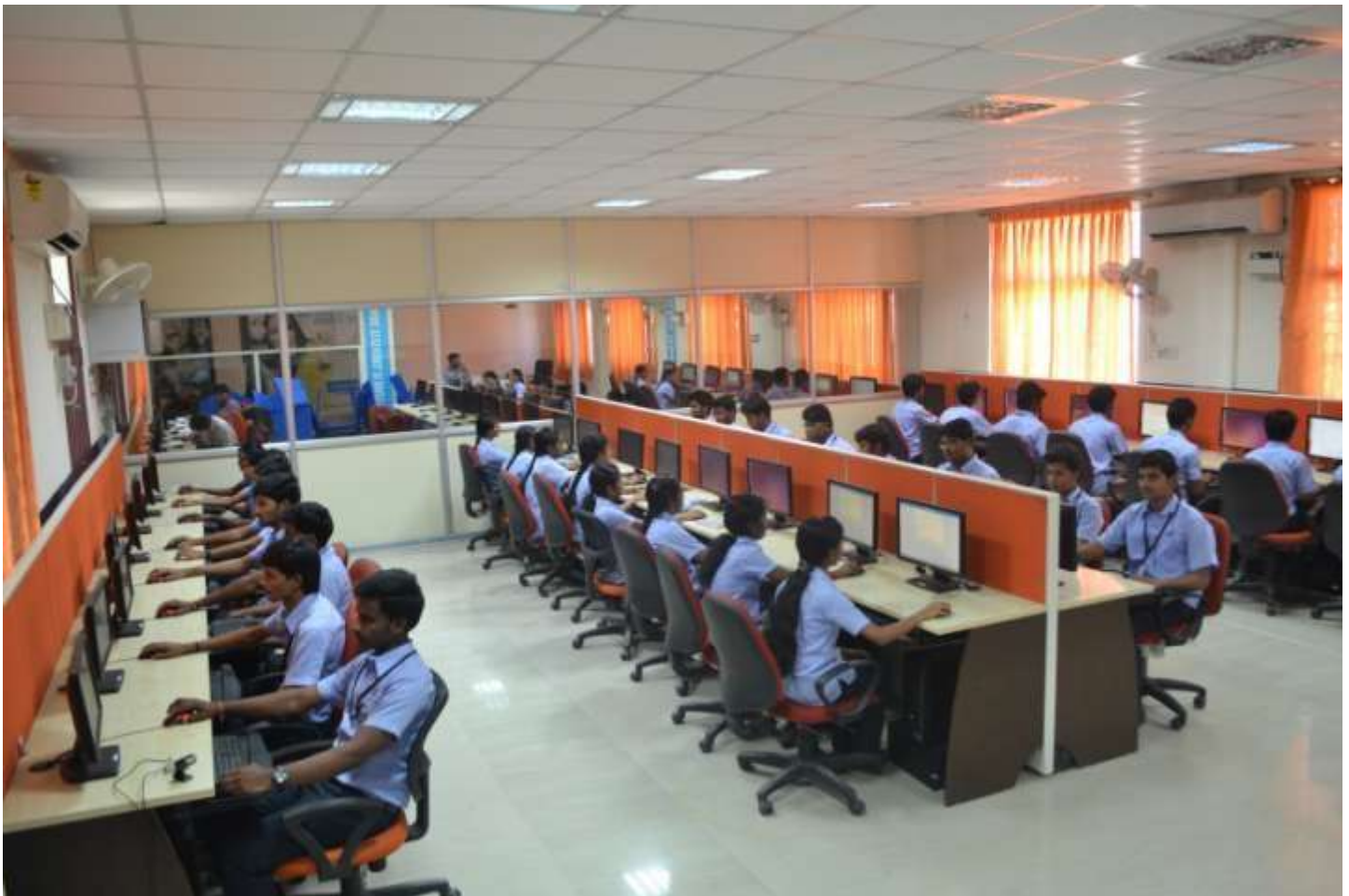
STUDENTS GETTING TRAINED IN CAD, CAM AND CAE

Objective: To improvise students in the emerging areas of design by imparting recent technologies and advanced software's that are adapted in industries and research purpose with the help of advanced training facilities and expertise faculties to meet the global needs of society and industries.