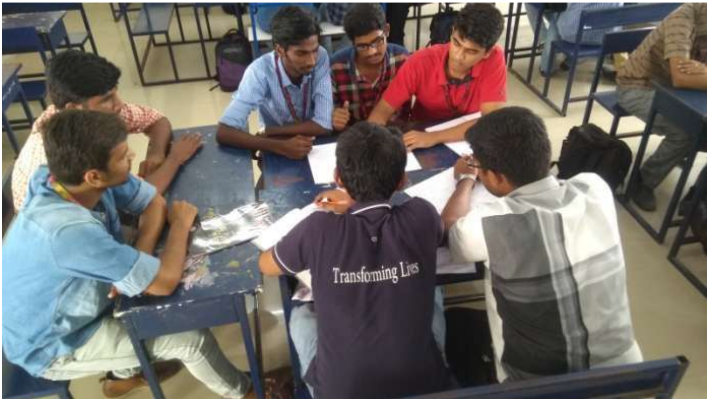
Peer group learning

Objective: To improve the performance of slow and average learner students, the peer groups are formed with each group consisting of 8 students in which two are advanced, two are average and four are slow learners.