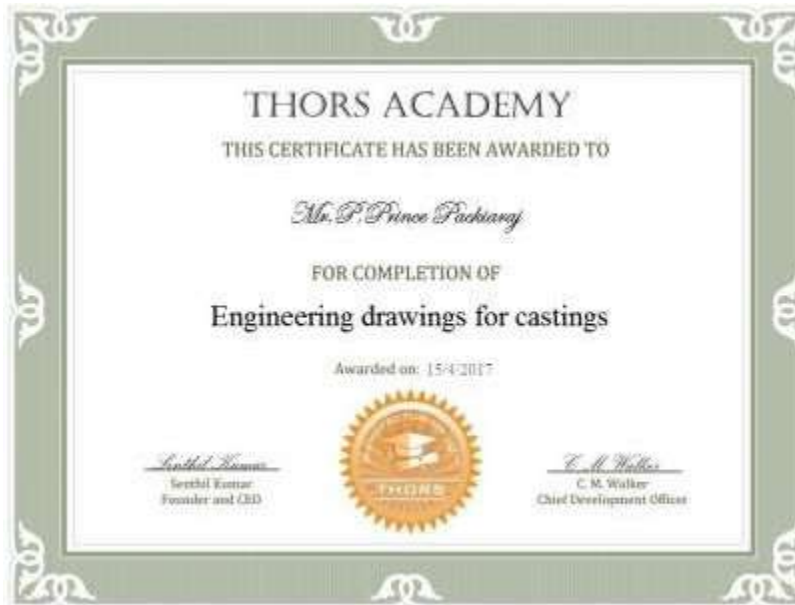
THORS ACADEMY CERTIFICATE OF FACULTY

Objective: Online courses available for faculties and students to upgrade their knowledge in the latest technology with real time applications.