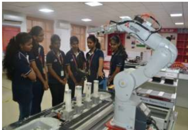
STUDENTS GETTING HANDS ON TRAINING IN AUTOMATION PROCESS