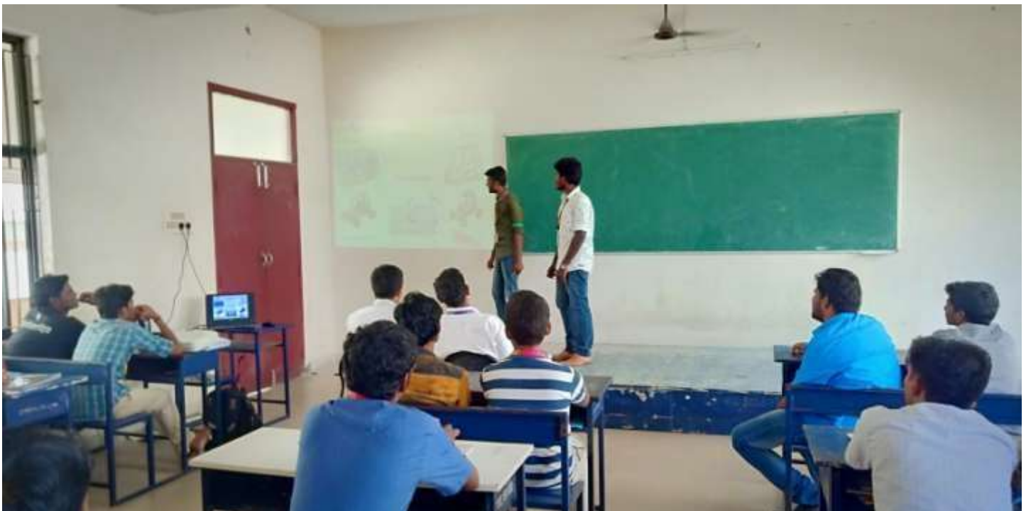
STUDENTS PRESENTING ON RECENT ADVANCEMENTS ON ATV

Objective: A presentation is a means of communication which can be adapted to various speaking situations, such as talking to a group, addressing a meeting or briefing a team. To be effective, step-by-step preparation and the method and means of presenting the information should be carefully considered. This program will not only exhibit student's technical skill along with managerial ability which is need for the growth of one's own professional and personal ability.