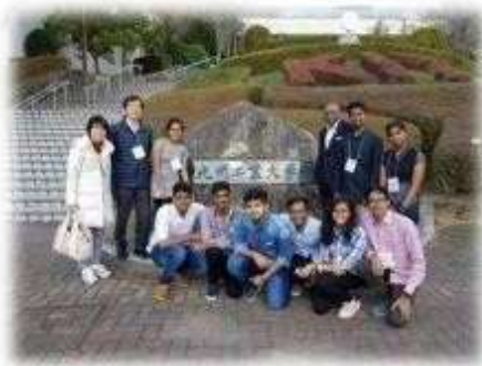
Students of CIT in Japan

Objective: Exchange of students between national and international level 100+ students every semester. In this initiative student gets benefited in terms of technology, knowledge and cultural exchange within India and abroad.