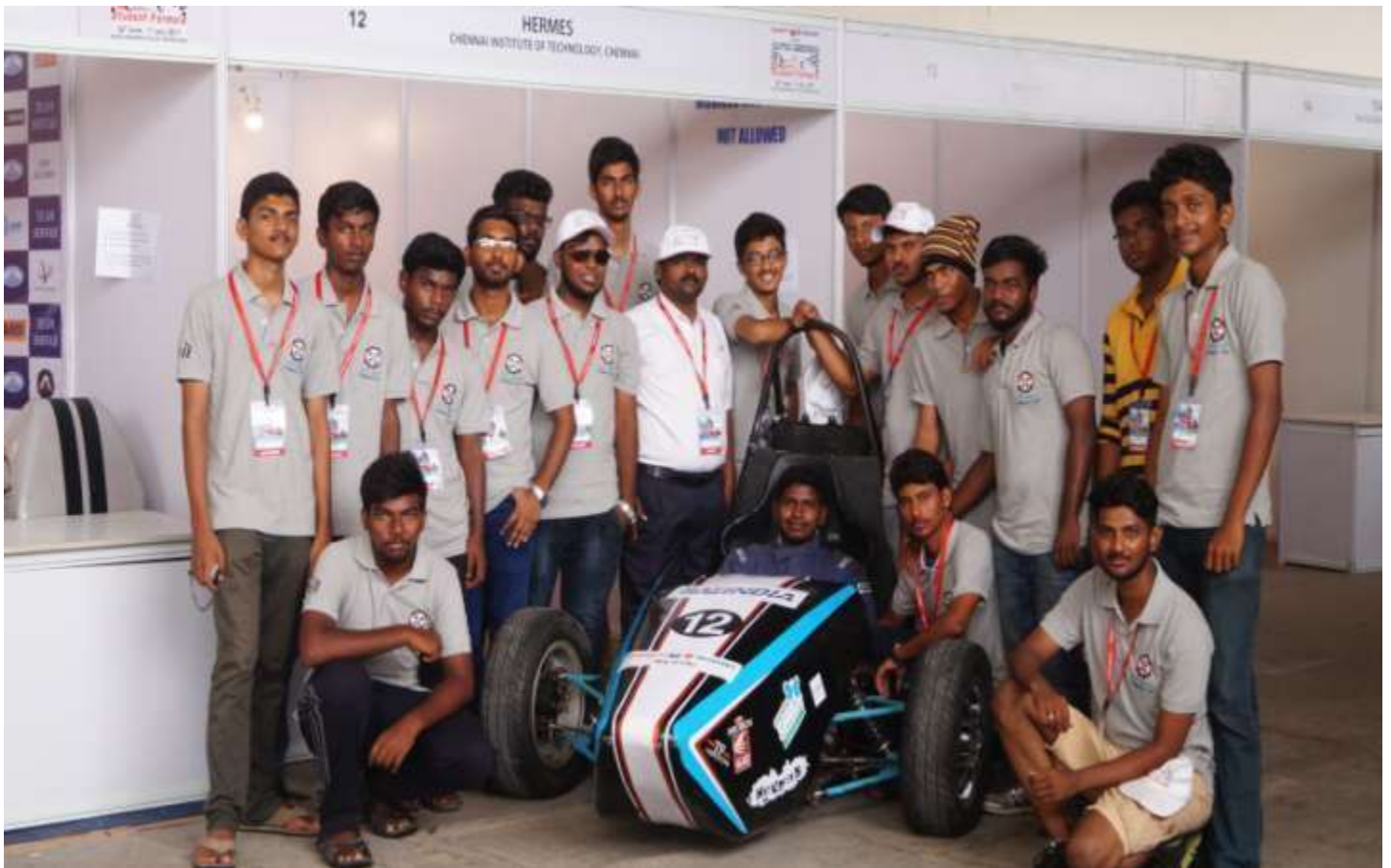
SAE-SUPRA -F1 CAR MANUFACTURING AND RACING COMPETITION

Objective: Competitions are conducted to improve the knowledge and hands on experience of recent design and manufacturing techniques among the students in an enthusiastic way.