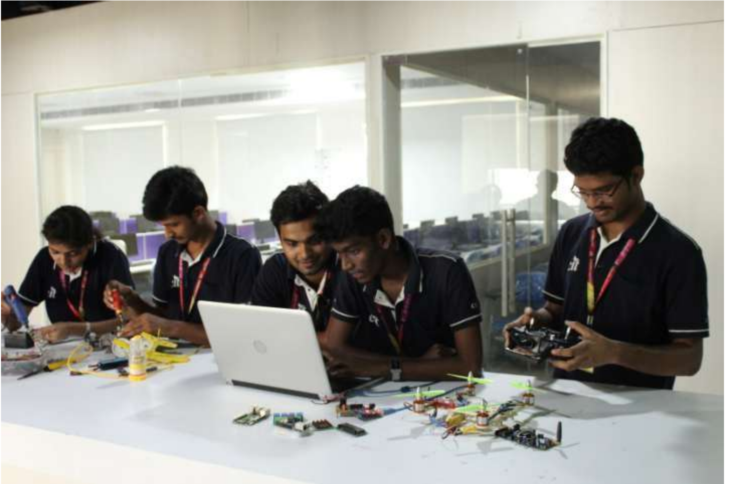
STUDENT MAKING GROUP PROJECTS IN INNOVATIVE LEARNING PROGRAM