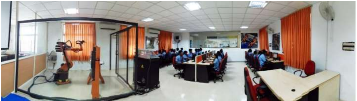
STUDENTS GETTING TRAINED ROBOTICS

Objective: As the world moving towards automation that can't be achieved without robotics, the next generation of industries is INDUSTRY 4.0 in this advanced era classroom teaching is not enough to fulfill the industry expectations. To overcome this scenario we have erected the ROBOTICS & AUTOMATION facility where students molded as industry ready.