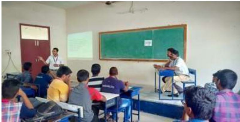
JUDGES ACCESING THE EVENT

Theme: "ENGINEERING TOWARDS INDUSTRY 4.0"