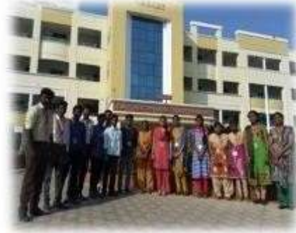
Students of CIT in C M R College of Engineering and Technology